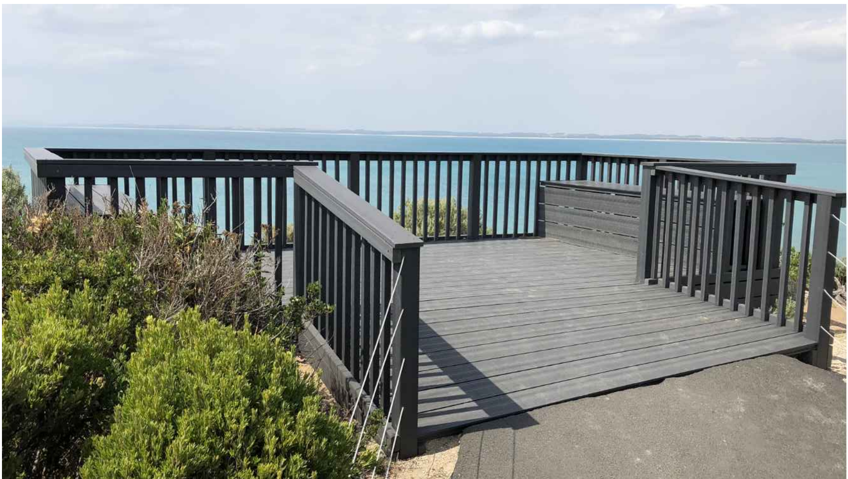
Image similar to the proposed viewing platform