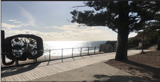
4. Port Noarlunga Jetty