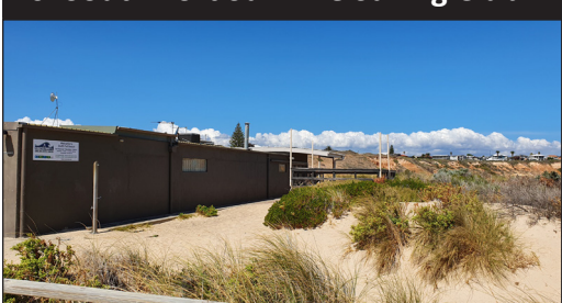
11. Onkaparinga River / Ngangkiparri