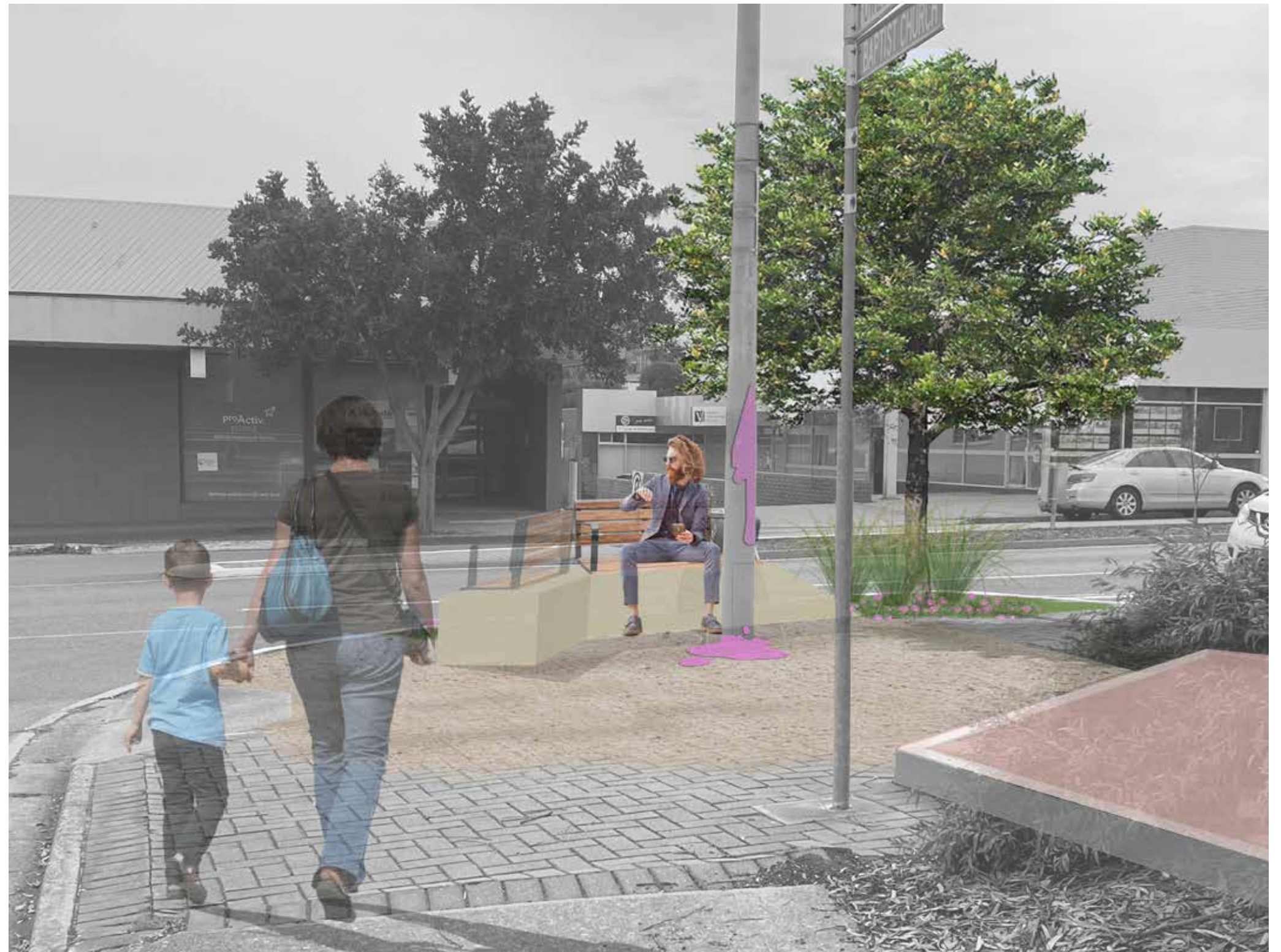
Artist impression - view the coast (46-48 Beach Road)