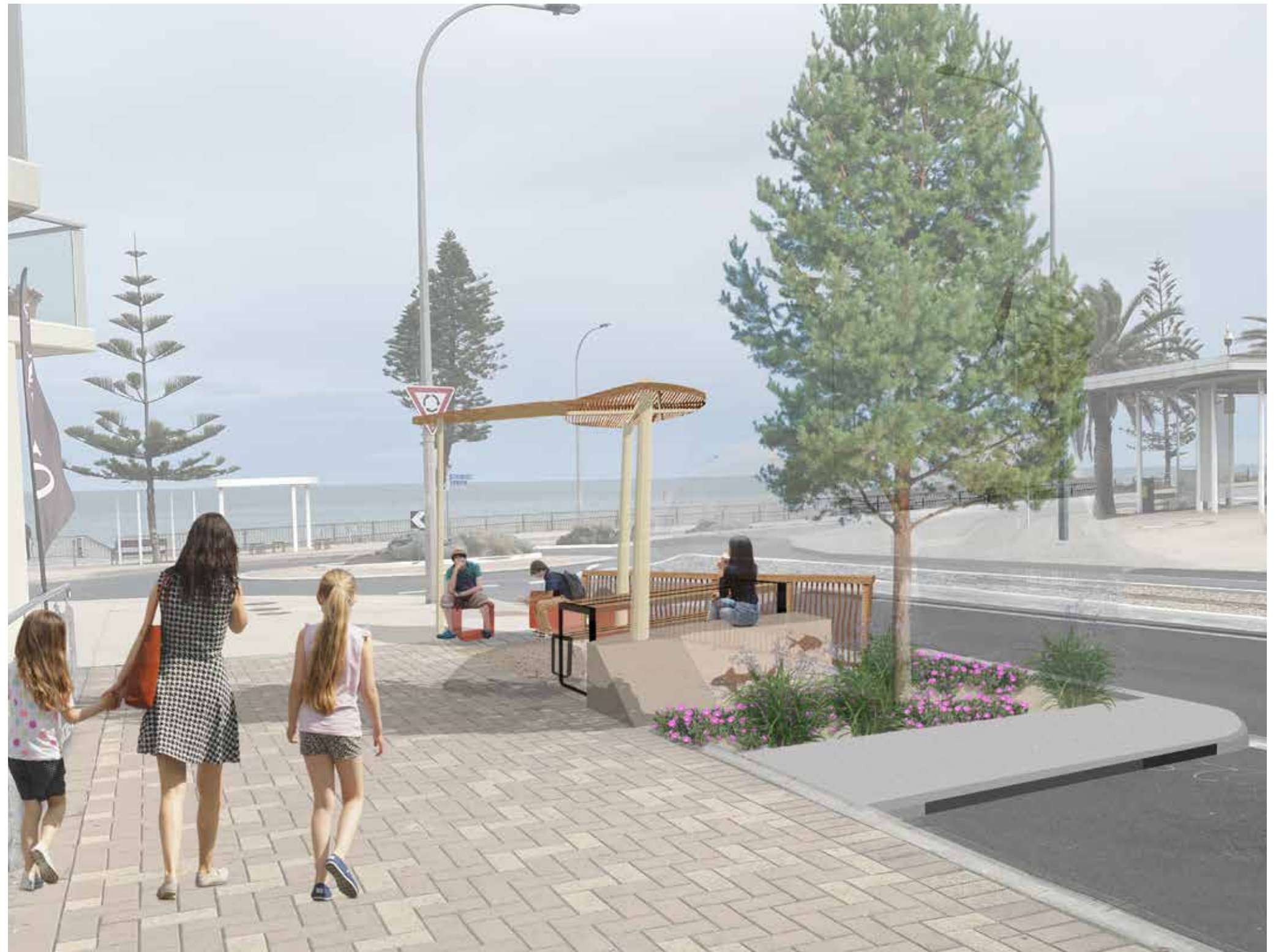
Artist impression - 4/50 Esplanade