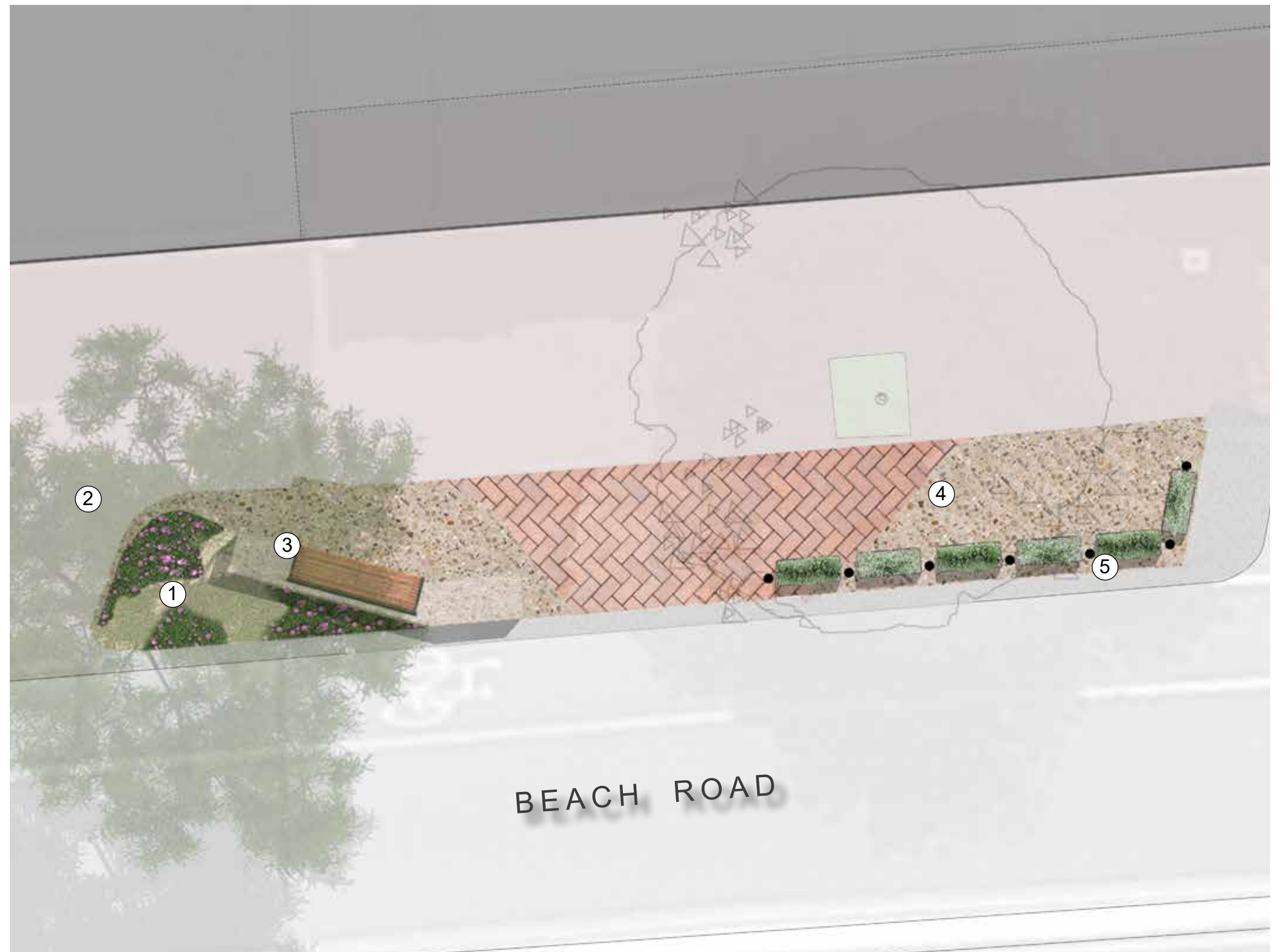
Nodal Point 5 (37 Beach Road) Plan