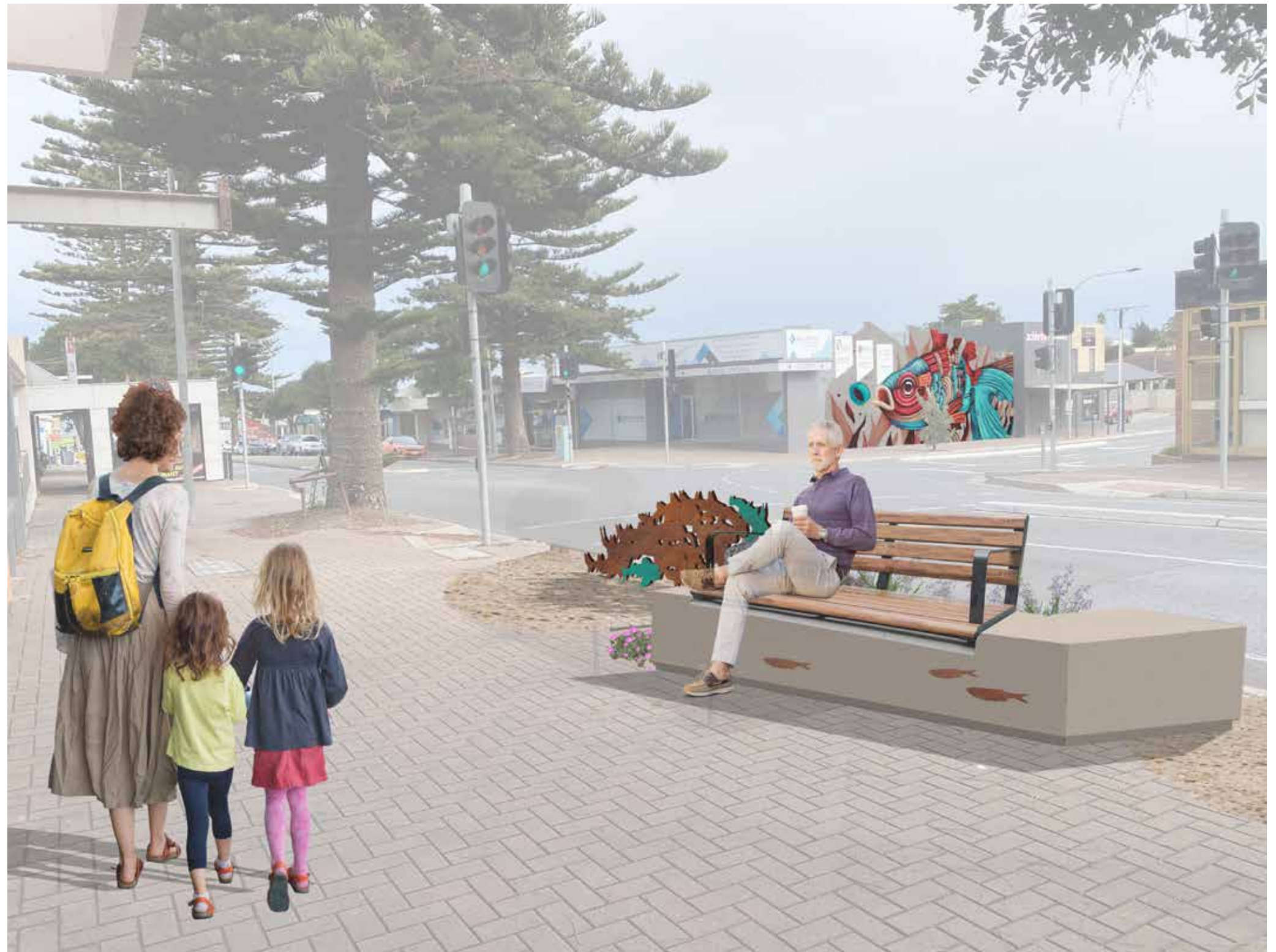
Artist impression - opportunity to rest (36 Beach Road)

* Mural art is only for illustrative purposes and an mural artist will be procured at a later date