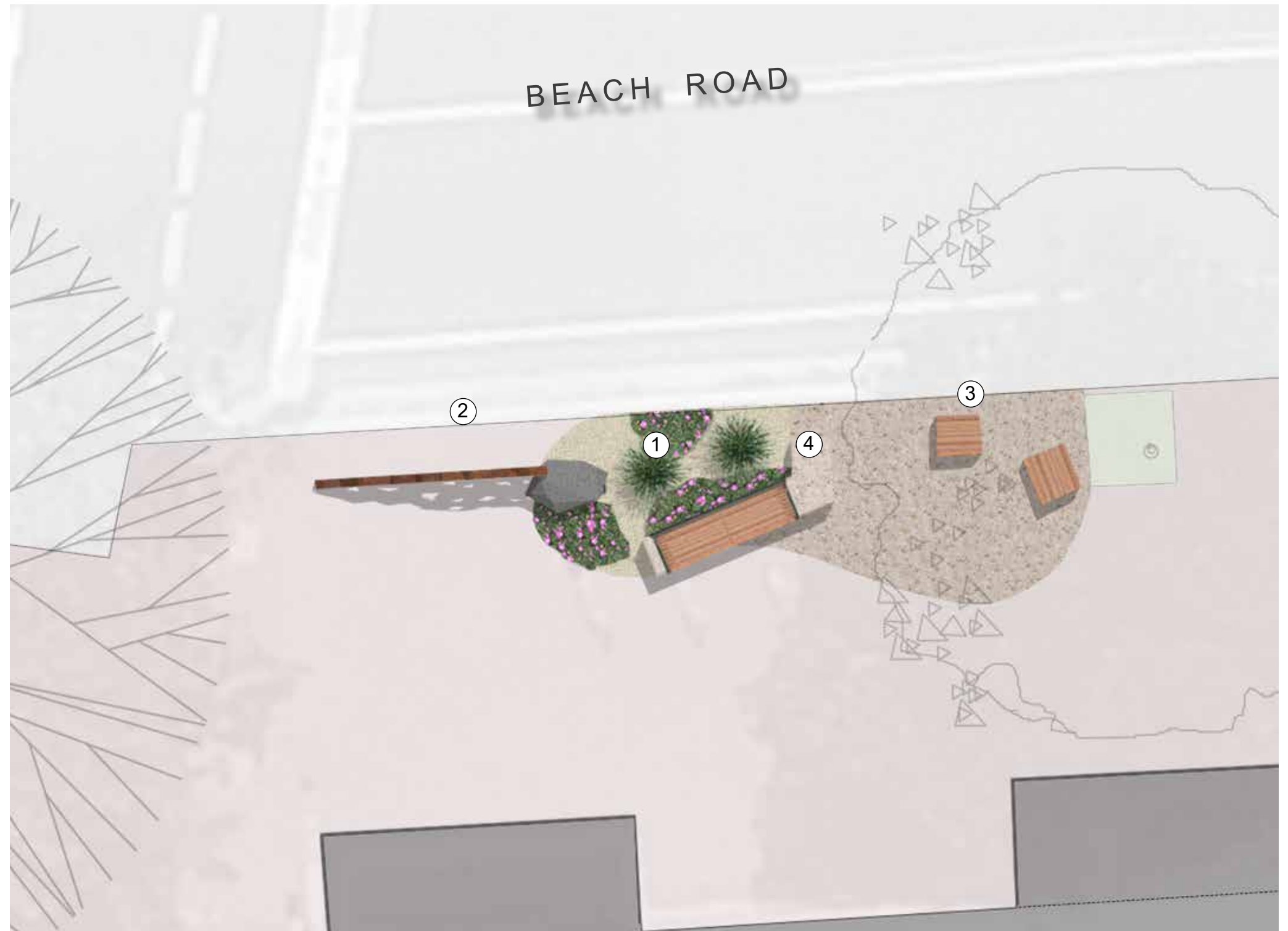
Nodal Point 4 (36 Beach Road) Plan