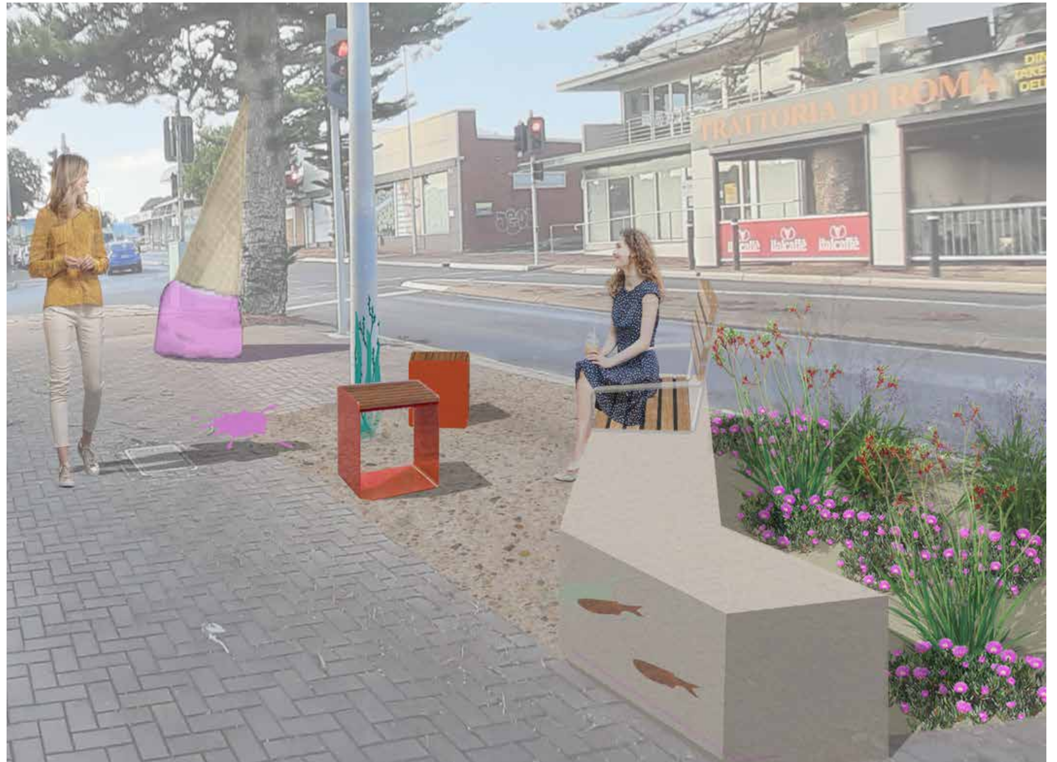
Artist impression - public realm (33 Beach Road)