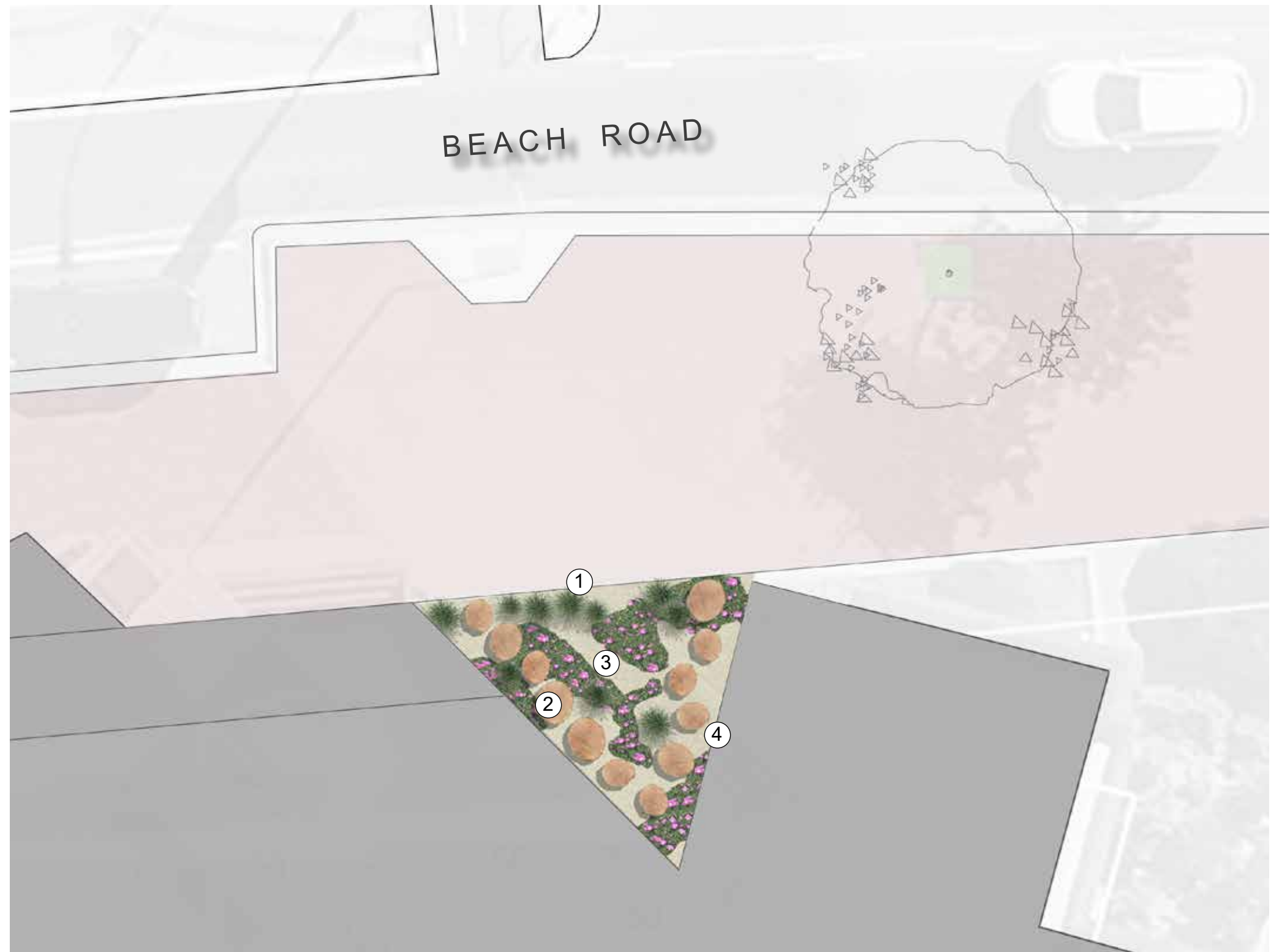
Nodal Point 2 (10 Beach Road) Plan