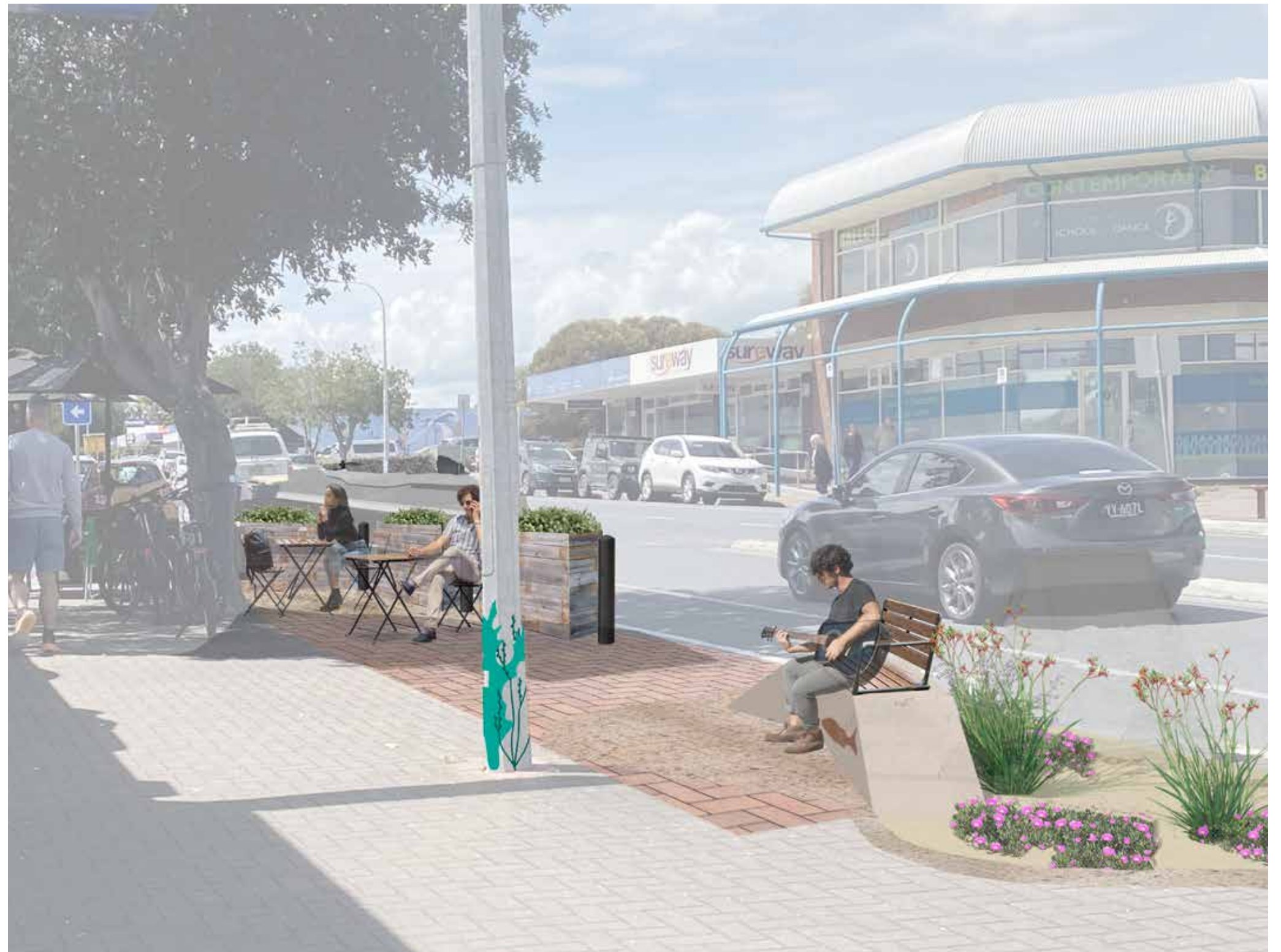
Artist impression - protuberance (37 Beach Road)