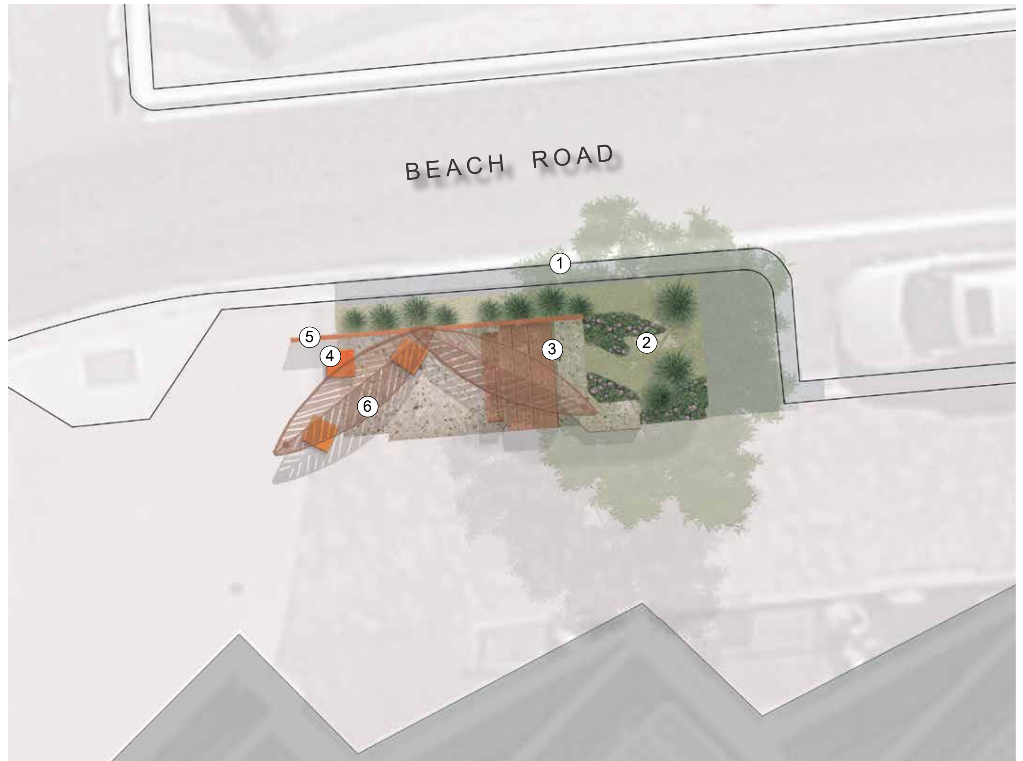
Nodal Point 1 (4/50 Esplanade) Plan