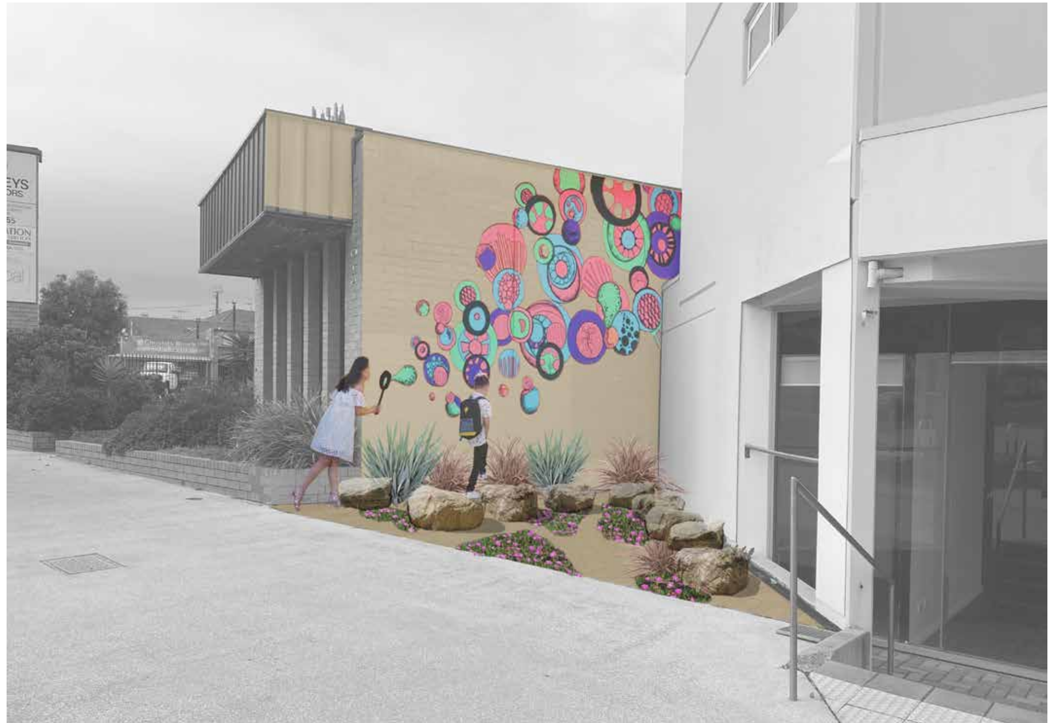
Artist impression - light touch pocket park (10 Beach Road)

* Mural art (#WhatLiftsYou by Kesley Montague Art) is only for illustrative purposes and an mural artist will be procured at a later date