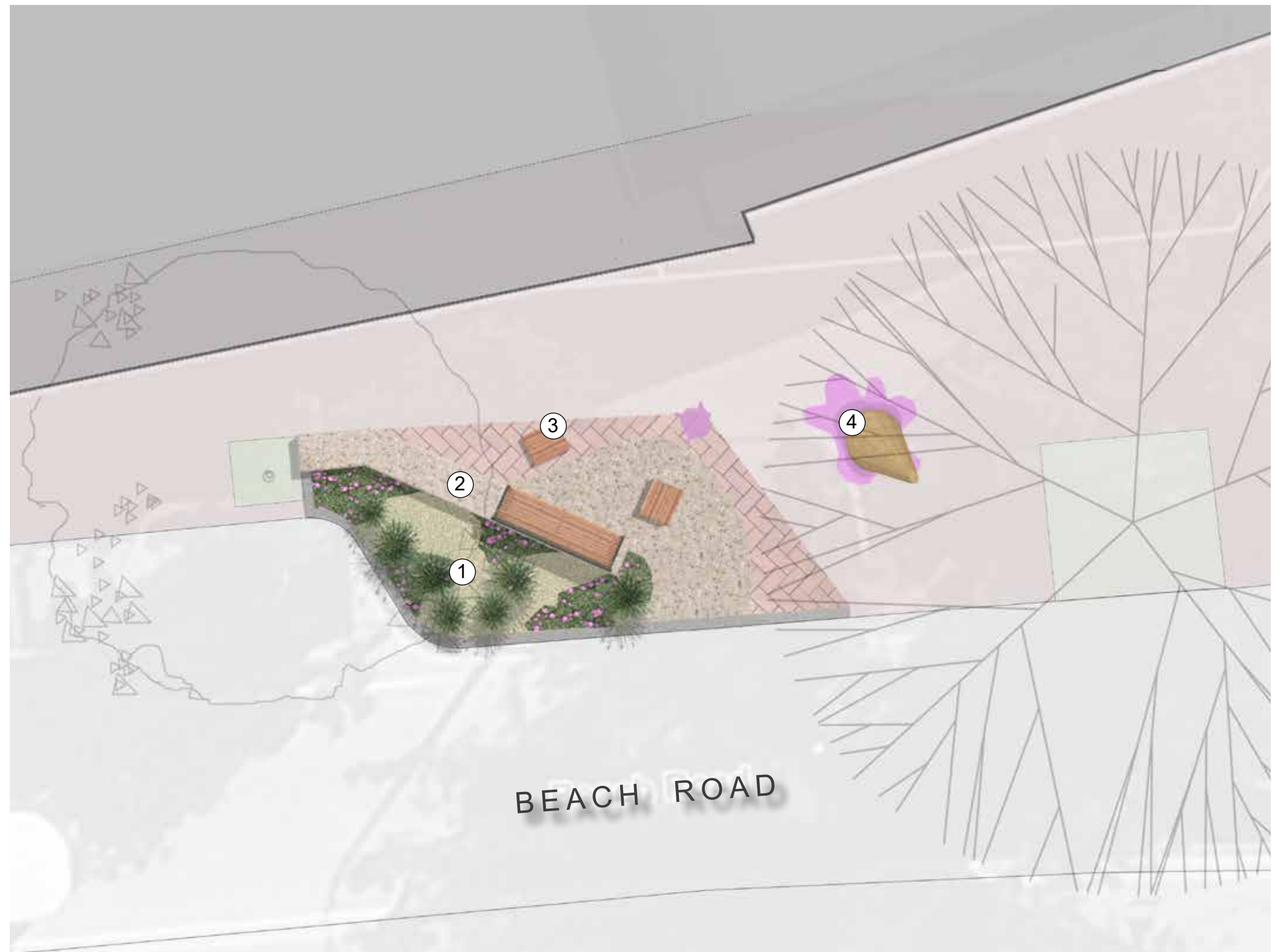
Nodal Point 3 (33 Beach Road) Plan