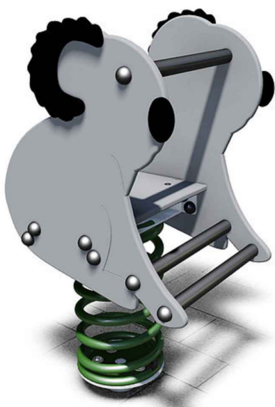
WILLPLAY KOALA ROCKER