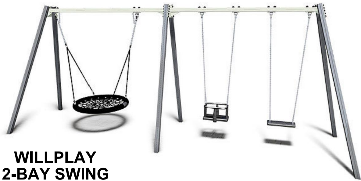
WILLPLAY 2-BAY SWING