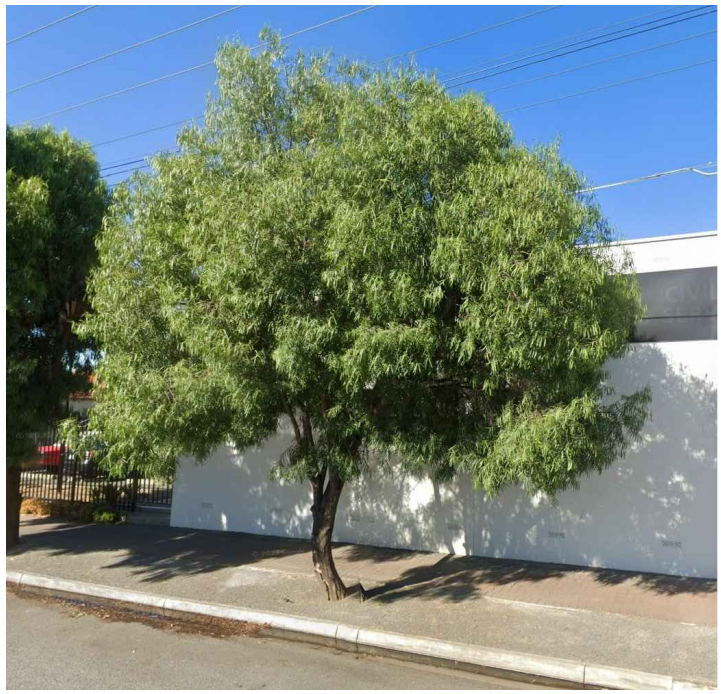
STREET TREE EXAMPLE