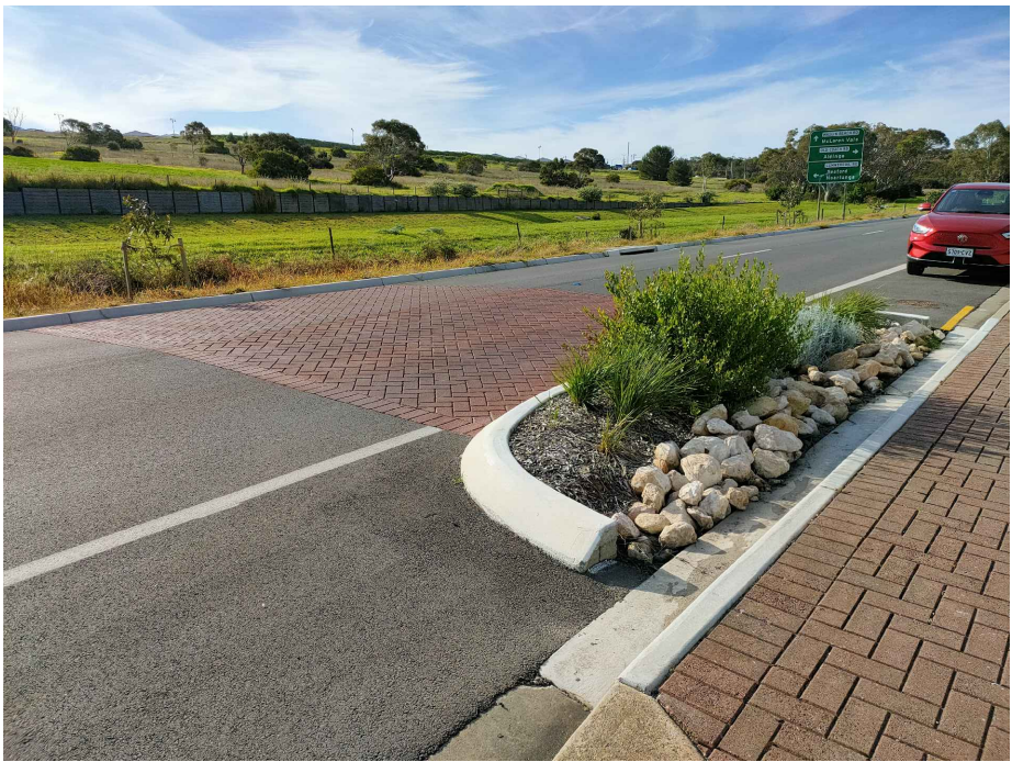
RAIN GARDEN EXAMPLE